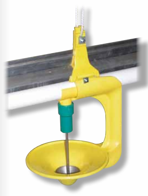
Available in both aluminum channel and conduit line support.

VAL-CO Turkey Watering can help you raise cleaner and healthier turkeys.