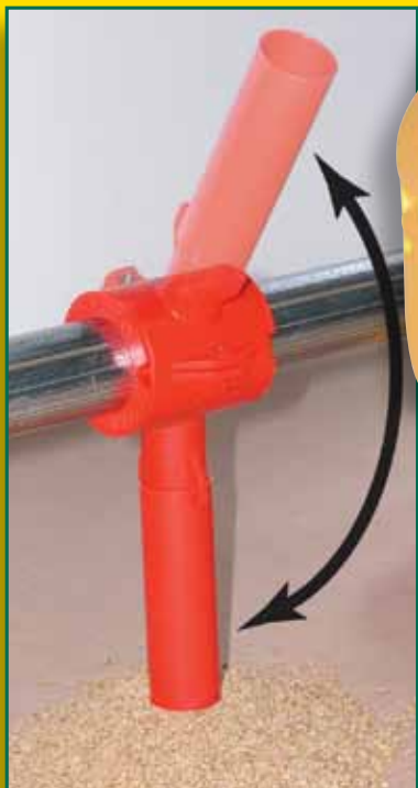
Above: The Best Start Chick Feeder