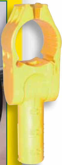
Above right: The Best Start II